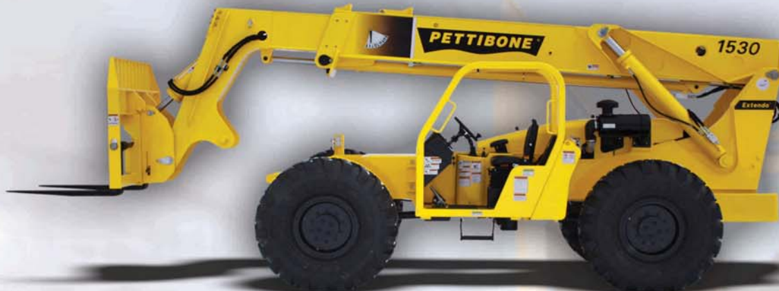
STANDARD FORK FRAME REACH